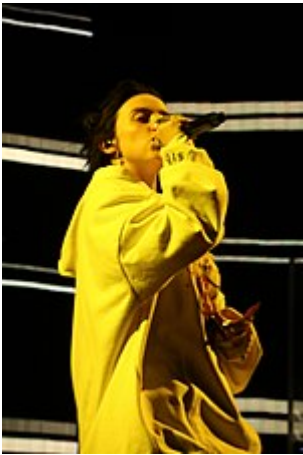
Eilish performing "Bad Guy" at the Red Rocks Amphitheatre during her When We All Fall Asleep Tour (2019).

In June 2019, Bastille covered "Bad Guy" at BBC's Maida Vale Studios as part of a medley that also included Lady Gaga's "Bad Romance" (2009), Taylor Swift's "Bad Blood" (2015), Dick Dale's "Misirlou" (1962) and their own "Bad Decisions" (2019). For their reinterpretation, Bastille added guitars and backup singers, and changed the song's lyrical plot by modifying the original line "I'm the bad guy" to "You're the bad guy". [65] The track was also covered by Two Door Cinema Club on Radio 1's Live Lounge the same month, [66] and by Alexandra Stan on Virgin Radio Romania in July. [67] "Bad Guy" was used for an advertisement for clothing manufacturer Calvin Klein's "My Truth" campaign. [68] It was included on the chart compilation album Now That's What I Call Music 103 , [69] and was used during the end credits of the 2019 superhero horror film Brightburn . [70] It is also featured on the 2019 dance rhythm game, Just Dance 2020 . [71] Among other parodies, one titled "Dad Guy" released by FunkTurkey on YouTube in August 2019, went viral. It replaces the original lyrics with jokes about fatherhood. [72]